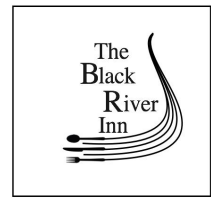
Table service is provided & we ask that during busy periods to please be patient. If you have an issue, please let us know, we can't solve any problems if you stay silent. Thank you for your understanding.